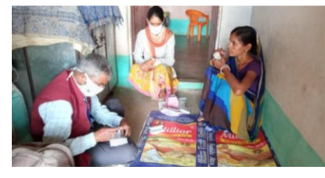
Door step deliverv of commodities