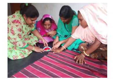
Providing information and access to contraception and menstrual hygiene management products at village level