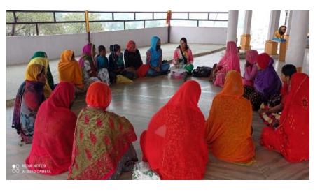
Training of Taruni Sakhis